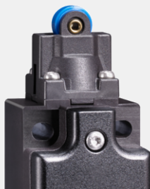
Roller plunger R

Material no. 1292311 1430320 on request 1430318