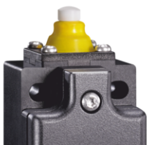
Plunger with collar W