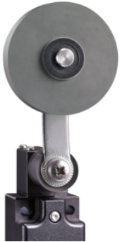
Rocking lever with rubber roller D50