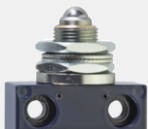
Ball plunger for front mounting FKU