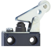
Parallel roller lever with collar WPH