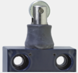
Roller plunger with collar WR