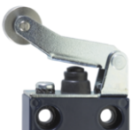
Long roller lever with collar WHL