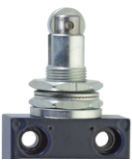
Roller plunger for front mounting FR