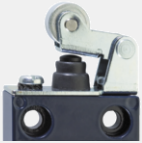
Roller lever with collar WH