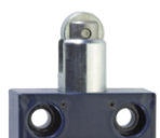
Roller plunger R