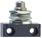
Plunger for front mounting F