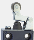
Offset roller lever with collar WHK