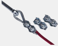
Duplex wire clamp 3410